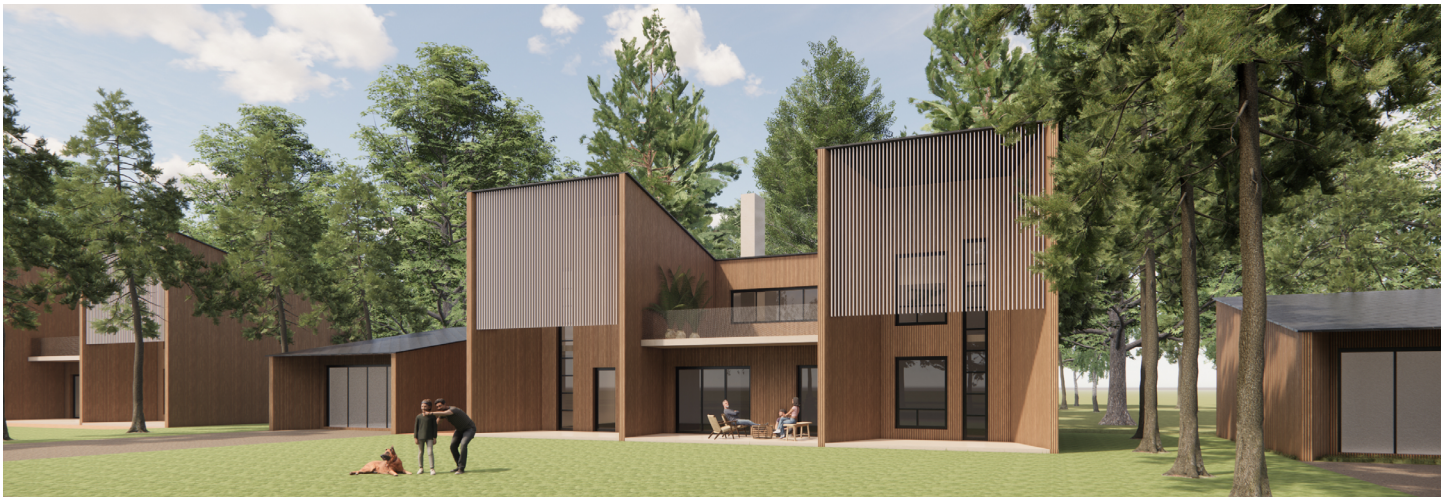
Design proposal of the Strömfors village sample house unit

B: building design I: interior design L: landscape design E: energy design U: urban design PM: project management D: documentation V: visualisation CC: communication coordination